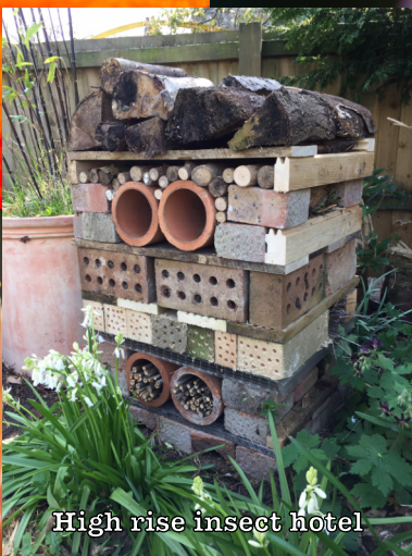
High rise insect hotel