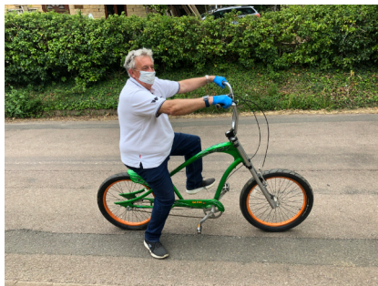
Flag flying and pedal power