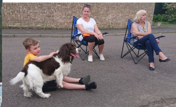
The Paddock & Meadow Gate Festivities