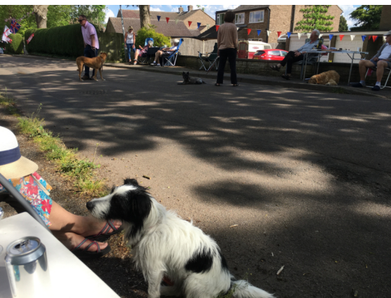
Dogs mastering social distancing on Orchard Lane