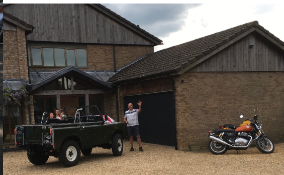
British Icons: Land Rover, Triumph & Royal Enfield!