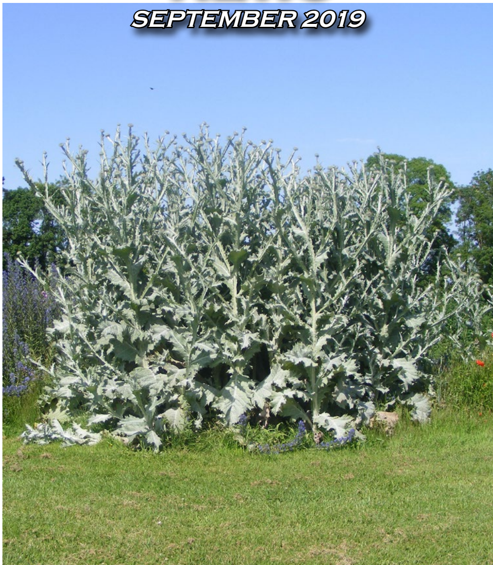
Triffid, Giant Hogweed or Thistle?