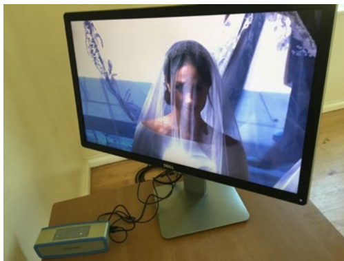
We watched on a Chromecast connected screen in the Village Hall using the WiFi while we prepared for the Bingo!