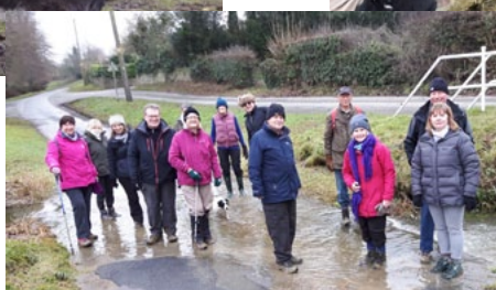
Friendly donkey, muddy boots & Barnwell Ford boot cleaning.