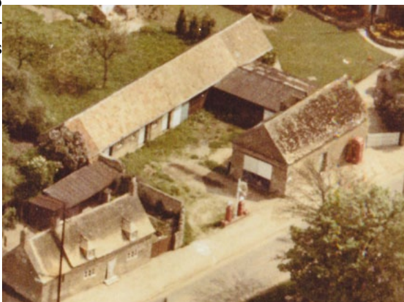
The Old Garage and Petrol Station