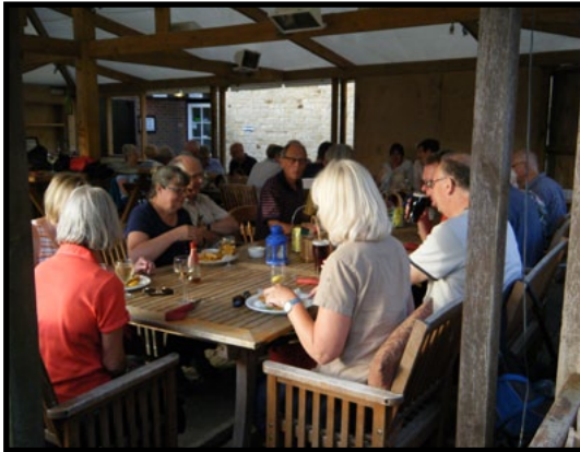
Gary's Walk - fish and chip supper at The Shuckburgh Arms, July 2016 See page 8