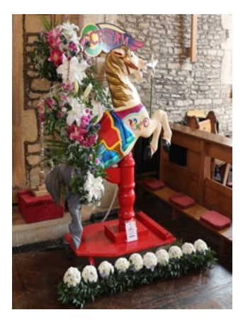
"Carousel" by Yvette Halewood