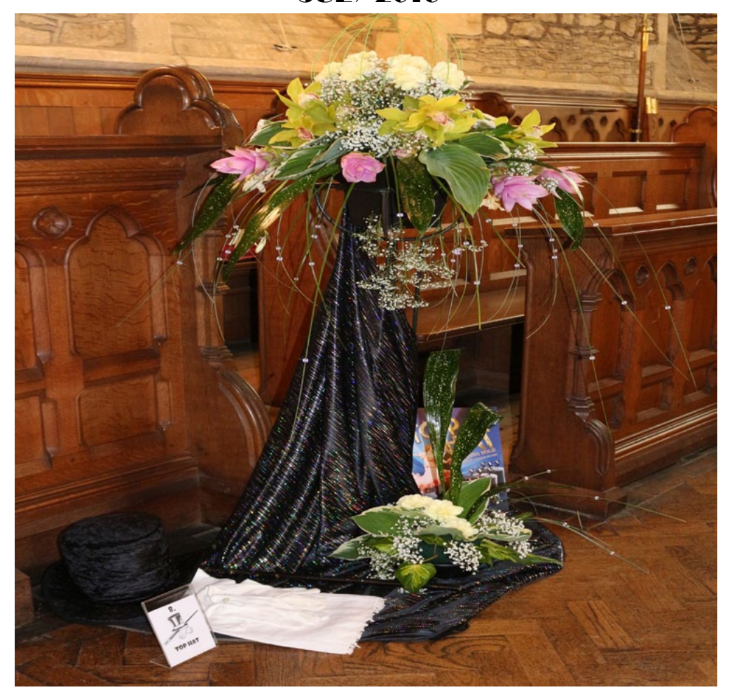
"Tophat" by Ann McLeod