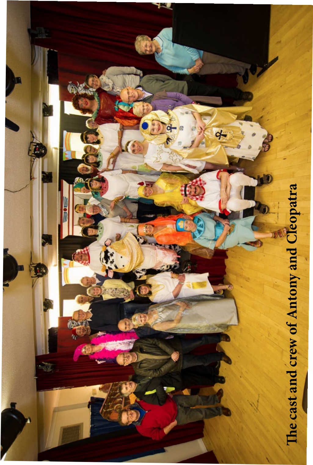
The cast and crew of Antony and Cleopatra